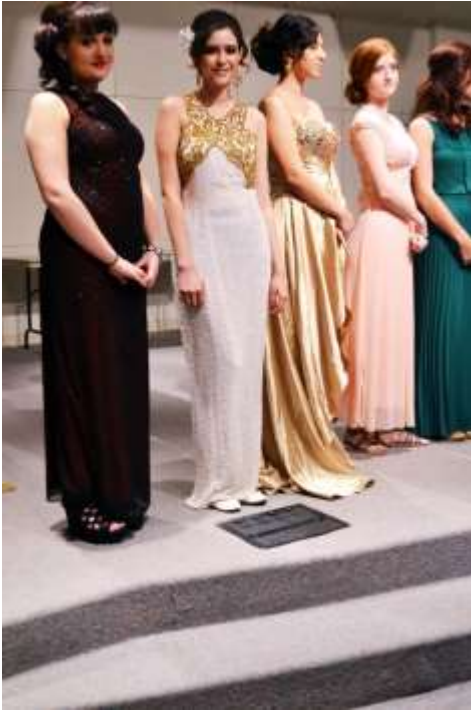
Prom Hair & Fashion Show displays Cosmetology students' skills