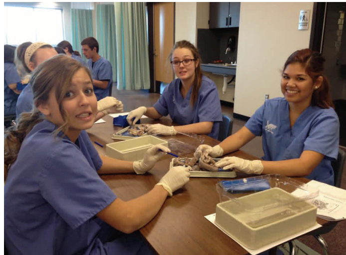
EVIT East MC10 dissecting pig hearts