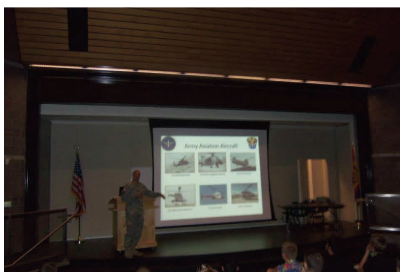
US Army—Aviation Guest Speakers