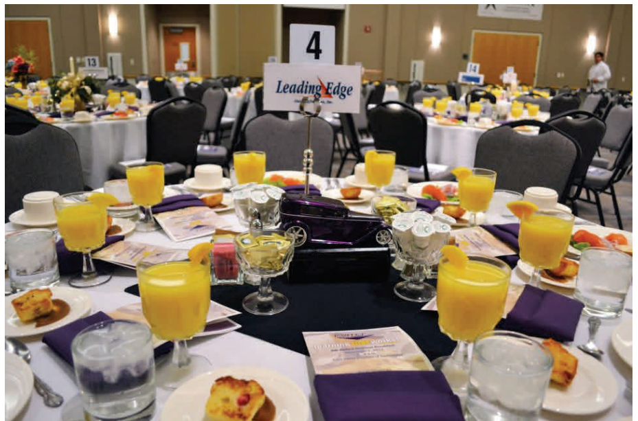
350 people enjoyed a sold-out EVITEF, Inc. Breakfast on Nov. 7th