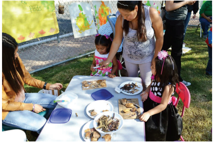
Early Childhood Professions Fall Festival