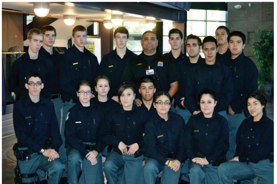
Law Enforcement Students donate hygiene products to Helen's Hope Chest