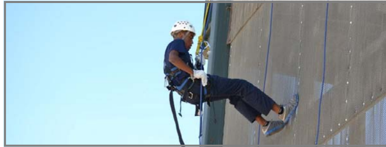
Second-year Fire Science students conquer their fears and learn to rappel from the fire tower.