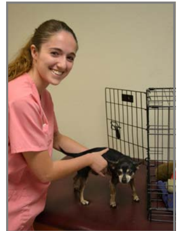
Veterinary Assisting students take time during class to pose for a few pictures with "Javier" for new EVIT brochures.