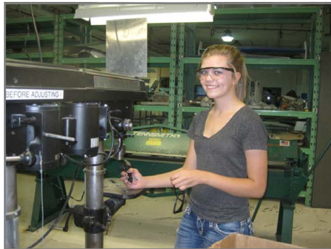
EVIT Aviation students get a jump start on college and career by taking courses at Chandler-Gilbert Community College.