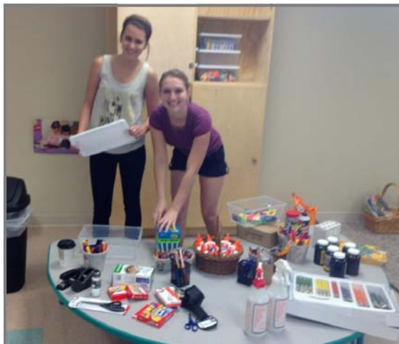
Early Childhood Education students helped clean, set up and organize the Bridges Preschool classrooms to get ready for students starting Oct. 1.