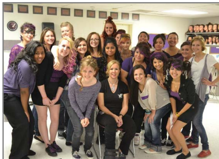
The weather didn't fully cooperate for but Mrs. French's cosmetology class was quite festive with their purple hair contest on Spirit Day!

Stay up to date with the latest pictures and events at www.Facebook.com/EVITnews!