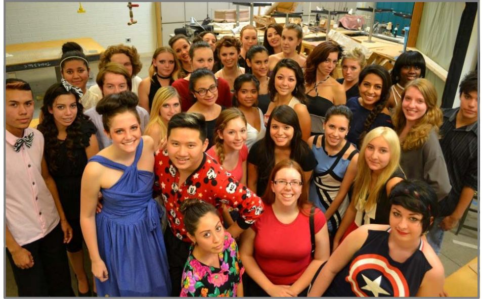
Fashion merchandising students transform simple t-shirts into intricate and creative outfits!