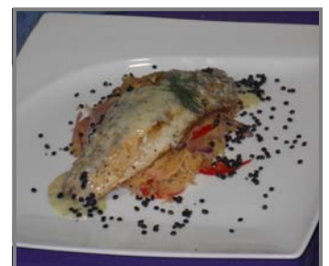
EVIT Culinary students and instructors provided cooking demonstrations at the Maricopa County Home & Landscape show at the Arizona State Fairgrounds Sept. 28-30.